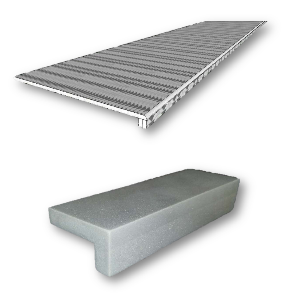
Figure 4- drop edge sample- <u>NOT</u> recommended

Drop-edges are <u>NOT</u> recommended as they will highlight the shade differences between the top and edge