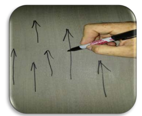
Figure 1-manually mark sheet direction before cutting

Mark sheet in multiple areas so all project parts are labeled