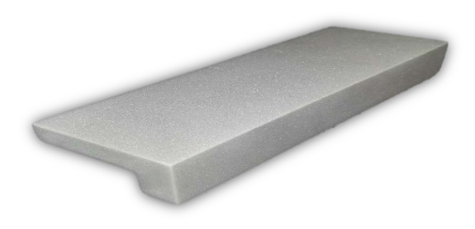
Figure 2-Miter Edge sample