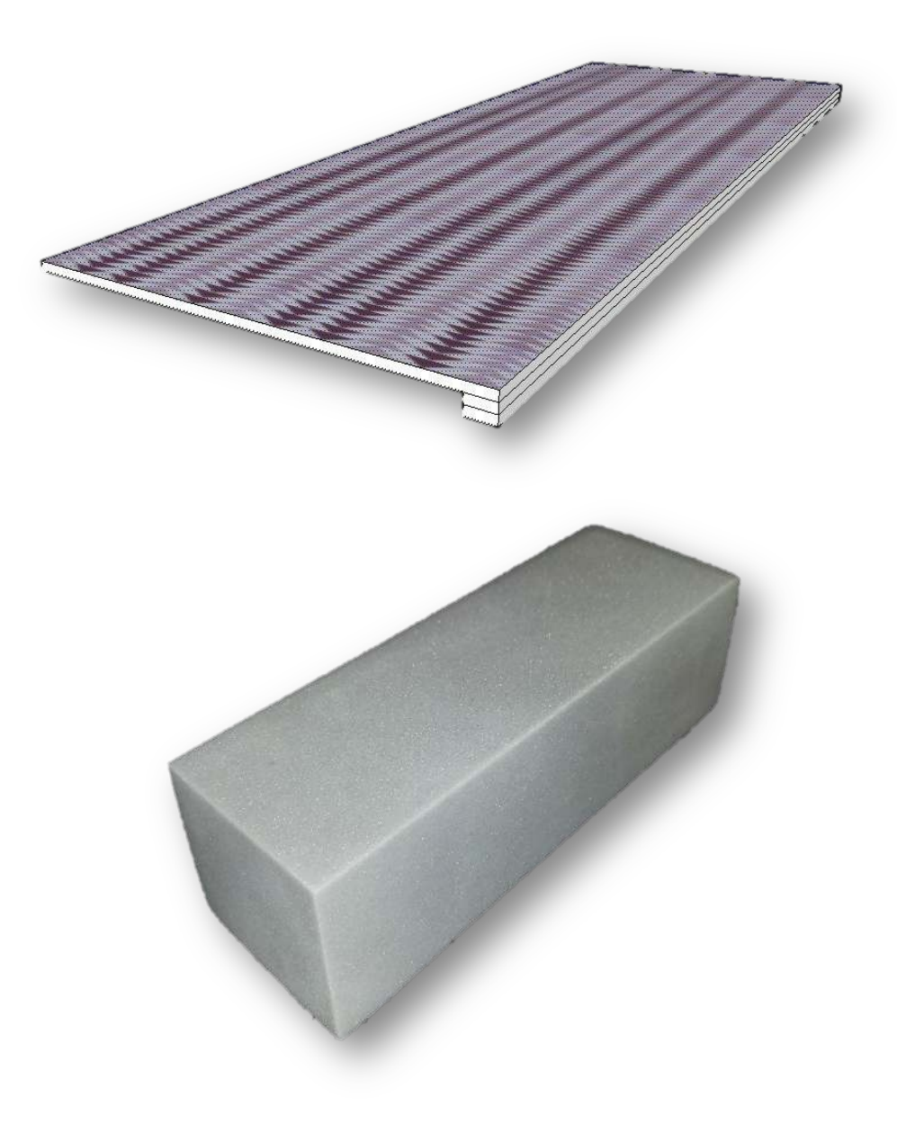
Figure 3-Stacked Edge sample

Stacked-edges give the best appearance from top to edge transition